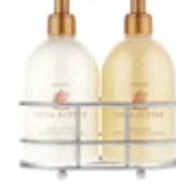
Wash & Lotion